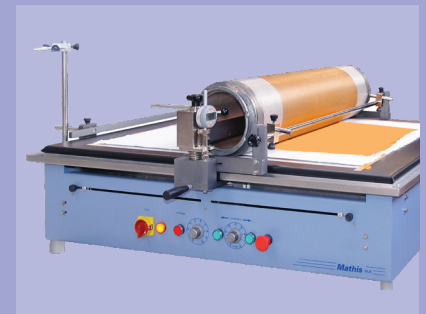
rotary screen with rubber squeegee