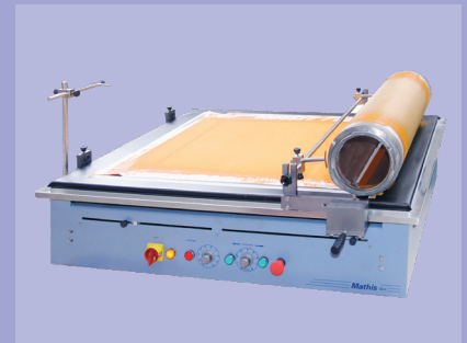
rotary screen with electromagnetic bar