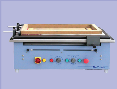
flatbed screen with electromagnetic bar

Application distance can be set in both directions, by means of limit switches, in order to obtain the desired application length. Repeated applications possible in both directions.